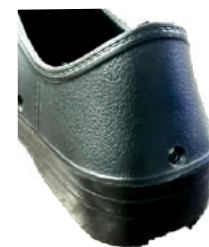
Rear Vents Ideal for drying