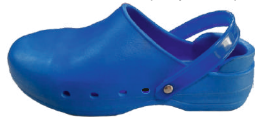
Only Side Vents (4 on each sides)