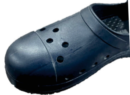
Standard Vents (5 top 4 sides)