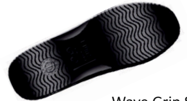
Wave Grip Sole