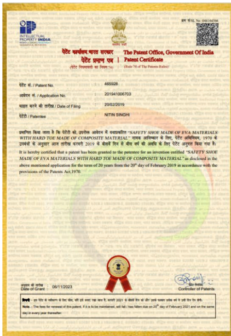
Patent- Cleanroom Shoes